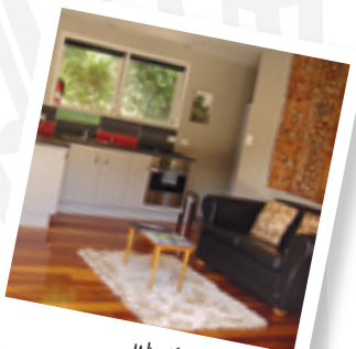
What's for lunch?

The open plan living area of the Kauri Suite has a full sized kitchen, separate dining area and spacious sitting room opening through double French doors to the elevated deck.