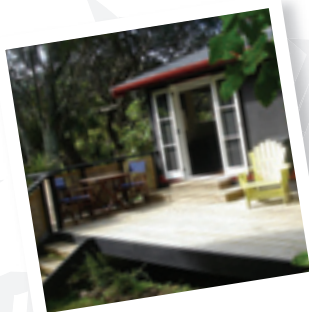
Oh, so private

Set in a private, sunny native garden the Tui has two decks for indoor/outdoor living where guests can enjoy both the sunrise and sunset. BBQ in the garden.