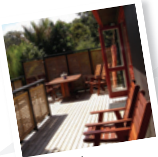
Our sunny deck...