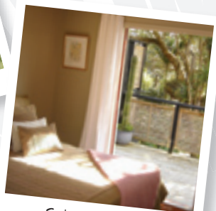
Feeling very spoilt

Relax in the king size bed as the sun pours through the French doors. With its own dressing room and quality linens this is Piha's best. Facilities include Sky TV, DVD, WiFi stereo and a complimentary first morning, continental breakfast.