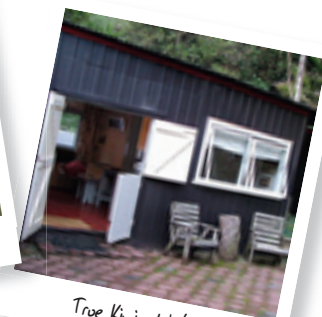
True Kiwi style!